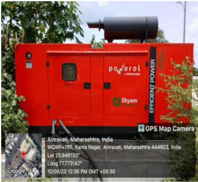
250 kva generator 1