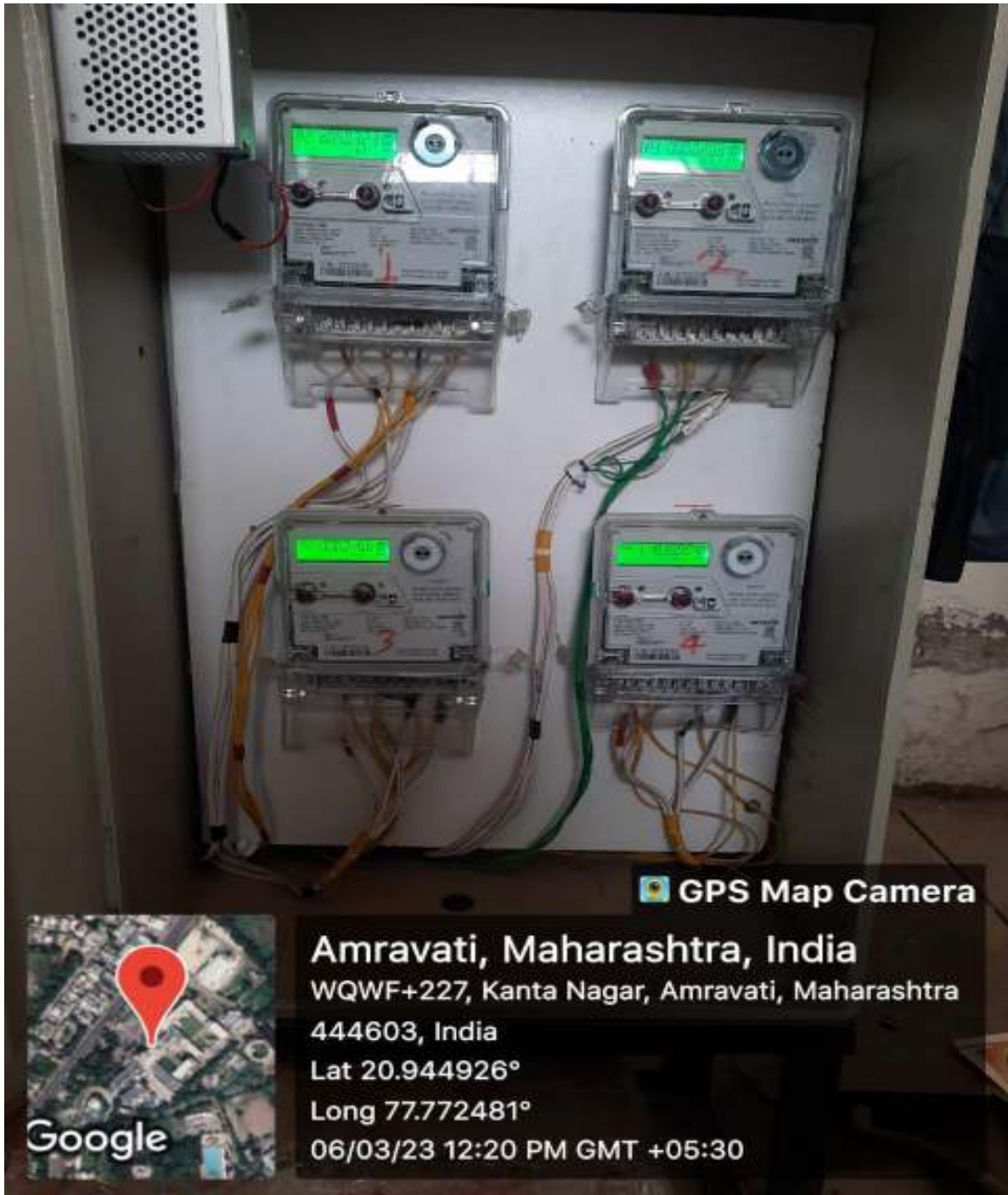
Image of meter showing Wheeling to the Grid