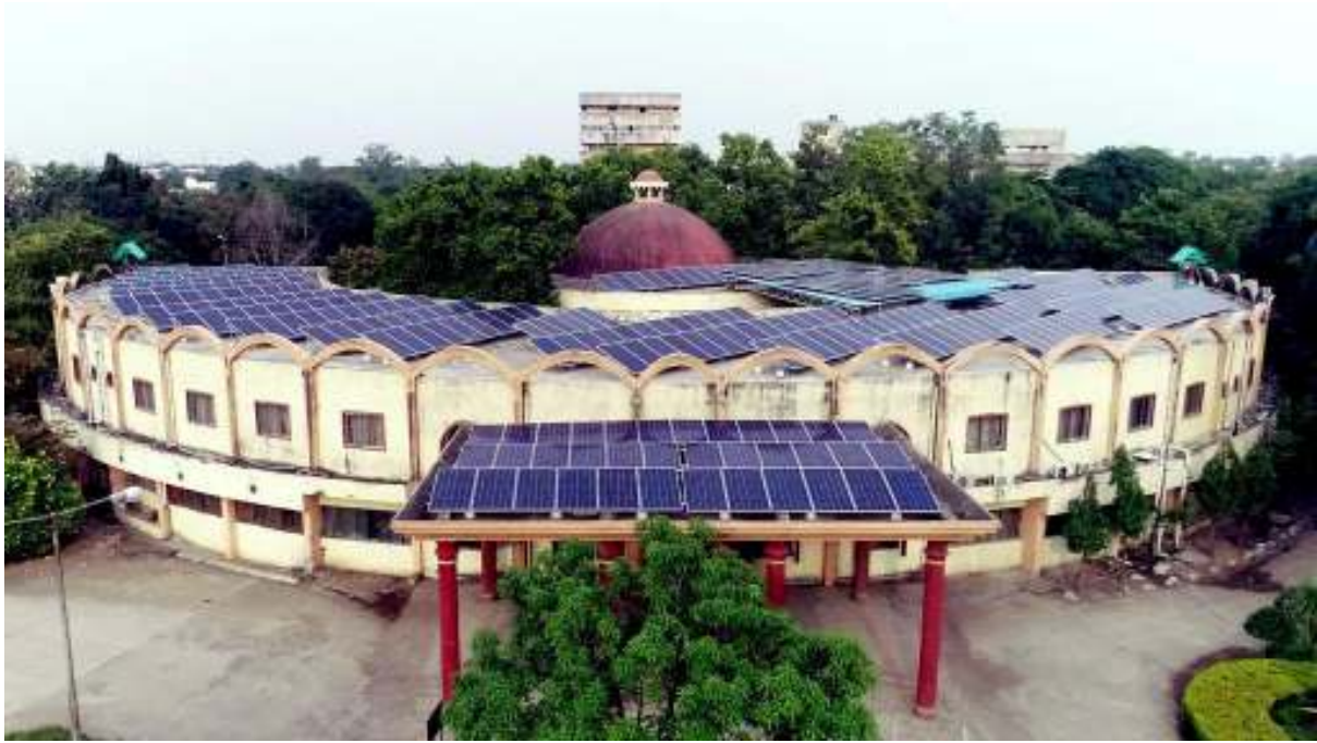
Image showing Solar Panels