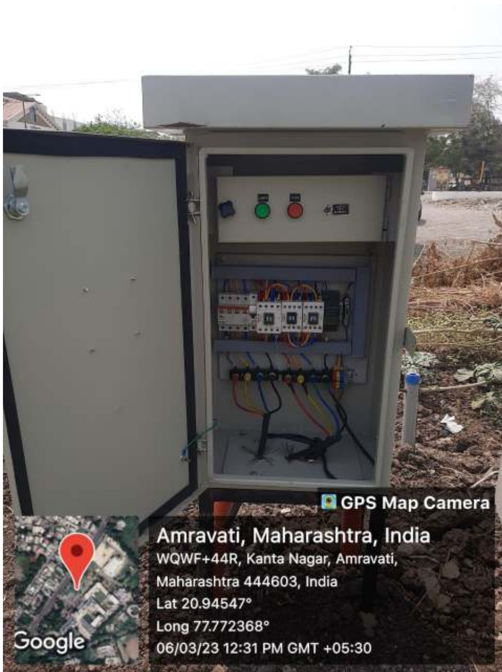
Image showing sensor module for streetlights used to conserve energy during daytime