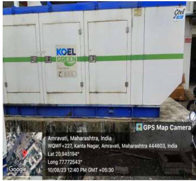
160 kva generator 2