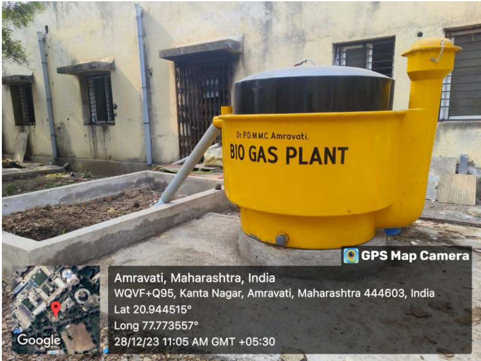
Image showing Biogas Plant