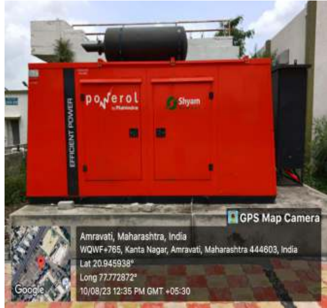
160 kva generator 4