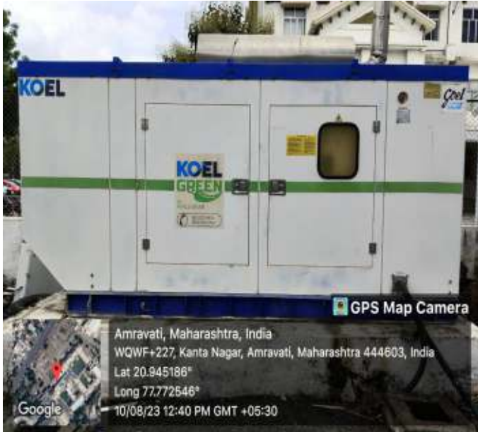
250 kva generator 3